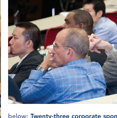
below: Twenty-three corporate sponsors exhibited at the symposium.